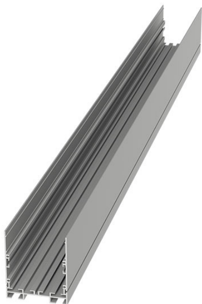
MIDDLE LINE 1 - 1059 × 75 × 88 mm