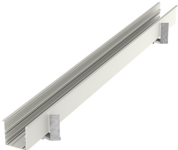
MIDDLE LINE 2 - 1059 × 75 × 88 mm